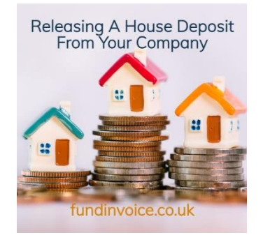
House Deposit? How we helped a client release a house deposit