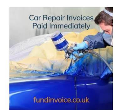
Factoring Garages How garages and spray shops can get paid