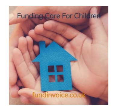
Funding Child Care Funding those offering